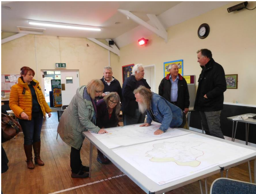
Consultation meeting at Somerleyton

The events were well attended, with 50 people visiting Somerleyton village hall, and 28 people visiting Lound village hall